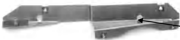
B Adaptor bracket